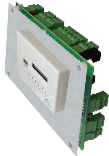
Photo shows cover in place on a simulated door.

A complete software support package MCS-CONNECT is available for your PC allowing for system configuration, dynamic on-line display screens, remote communication, graphing, and more.